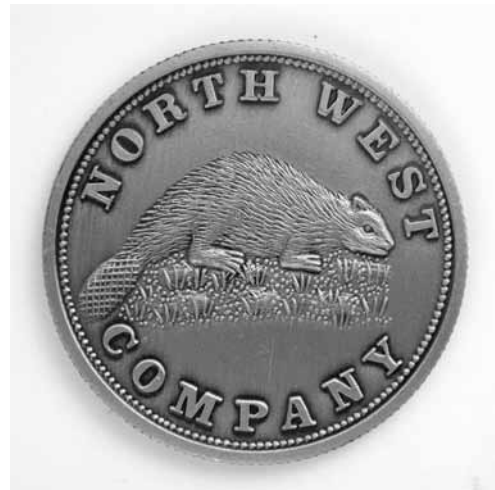
Modern replica of the North West Company "beaver" token dated 1820.