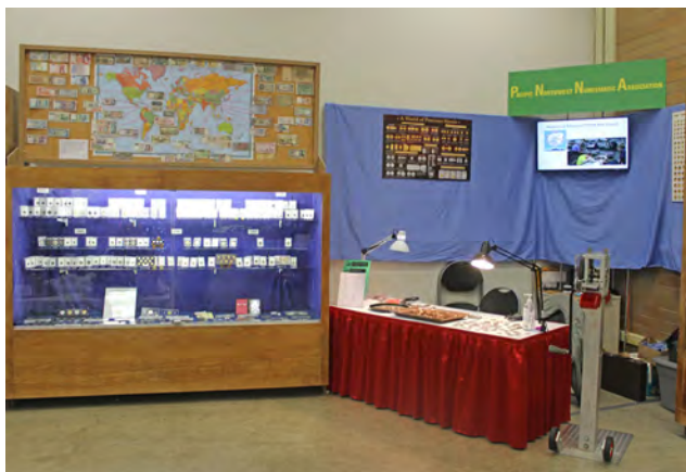
Photo: The PNNA display, including the "Penny Press," at the 2015 Washington State Fair in Puyallup.

Over 4,000 copper pennies were pressed into the familiar elongated shape.