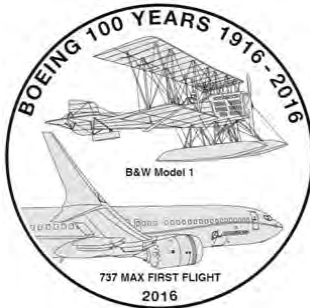
2016 Club Medal & Wooden Nickel