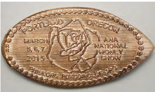
Artwork (top): Design for PNNA 2015 Tukwila convention elongated coins. The reverse canoe design, adapted from the PNNA 75th anniversary medal, was also used on the Portland fall convention elongateds. Photos: 2015 Tukwila and Portland convention elongated cents (common reverse); 2015 Portland ANA National Money Show elongated cent (blank reverse); 2015 Washington State Fair (Puyallup) elongated cent (blank reverse). Varieties, such as convention coins with blank reverses, also exist.