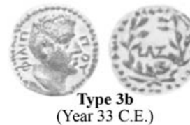
Type 3b (Year 33 C.E.)