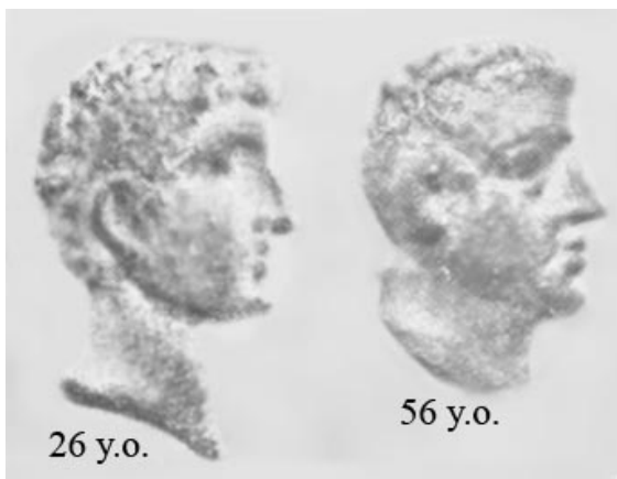
Fig. 3. Composite images of Philip's bust at ages 26 (Types 1 and 2) and 56 (Type 3).

There was clearly great care taken in the making of the obverse dies of Types 1 and 3. Even though the obverse die of Type 3 was saved for three years before minting resumed, an examination of the coins reveals that the die remained in optimal condition. It may therefore even be speculated that the die cutters of this bust and the bust of Philip on Type 1 were specially trained in Rome.