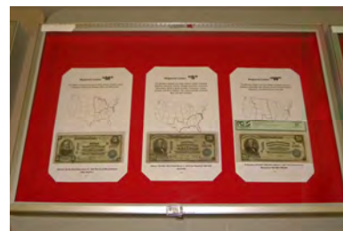
Photo: part of Tom Tullis' winning collector exhibit, "Letters to the Rescue!"

Congratulations to all winners. Why not consider an exhibit yourself at next year's Tukwila convention, or at the fall show in Portland?