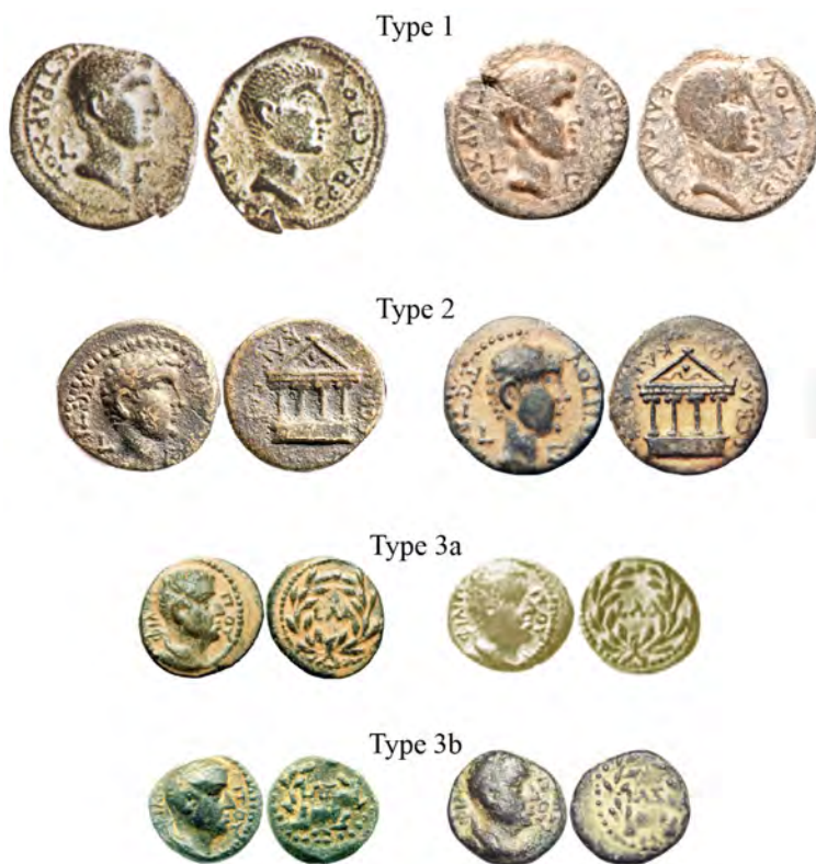
Fig. 4. The two finest specimens known for each type with Philip's portrait (Types 1-3b). Scale 1:1

In 34 CE, Herod Philip died and his coinage ceased to be minted. His land later became part of the province of Syria.