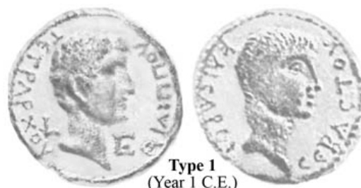
Type 1 (Year 1 C.E.)

Philip minted 16 types of coins at the mint of Caesarea Philippi, in the northern part of his territory. On his four rarest coin types, he depicted an image of his own portrait, being the first ruler of the NT to ever do so. Interestingly, two of these coin types were minted when Philip was about 26 years old in the year 1 CE, while the other two were minted when Philip was nearing death in his late fifties. Of these four coin types, only 31 coins are known, and their extreme rarities are quite noteworthy. Unfortunately, some of these coins were damaged by modern tooling.