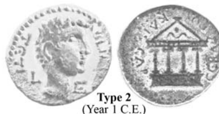
Type 2 (Year 1 C.E.)