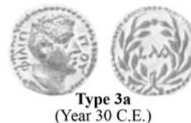
Type 3a (Year 30 C.E.)