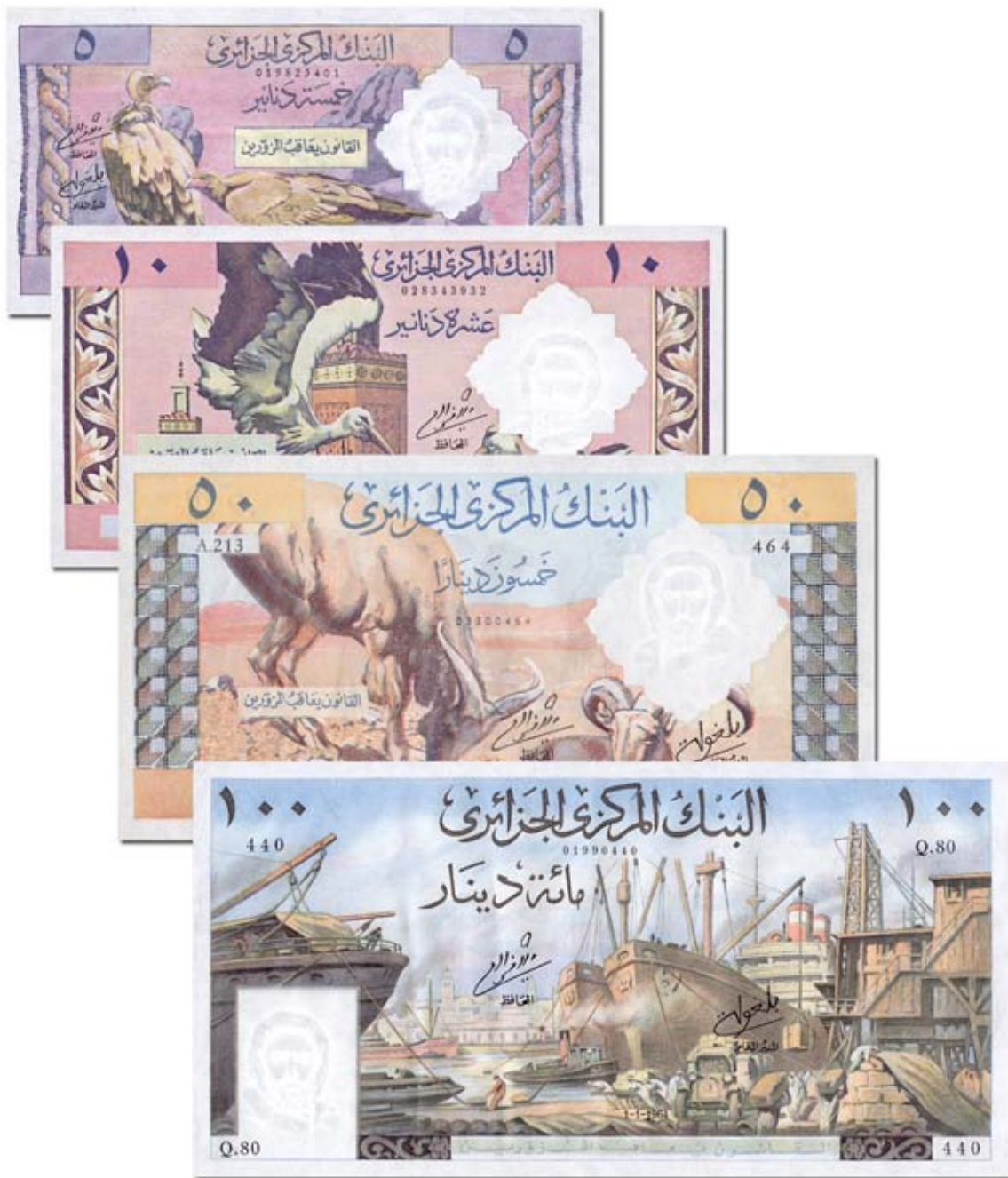
The initial series of Algerian dinar notes (issued by the Banque Centrale d'Algérie in 1964) followed the old French design format

1962, Algerians voted over 360 to one in favor of independence from France. On 5 July 1962, independence was formally declared. The notes of the Banque de l'Algérie continued to circulate until the introduction of the Algerian dinar in 1964, thus ending the era of the franc in Algeria.