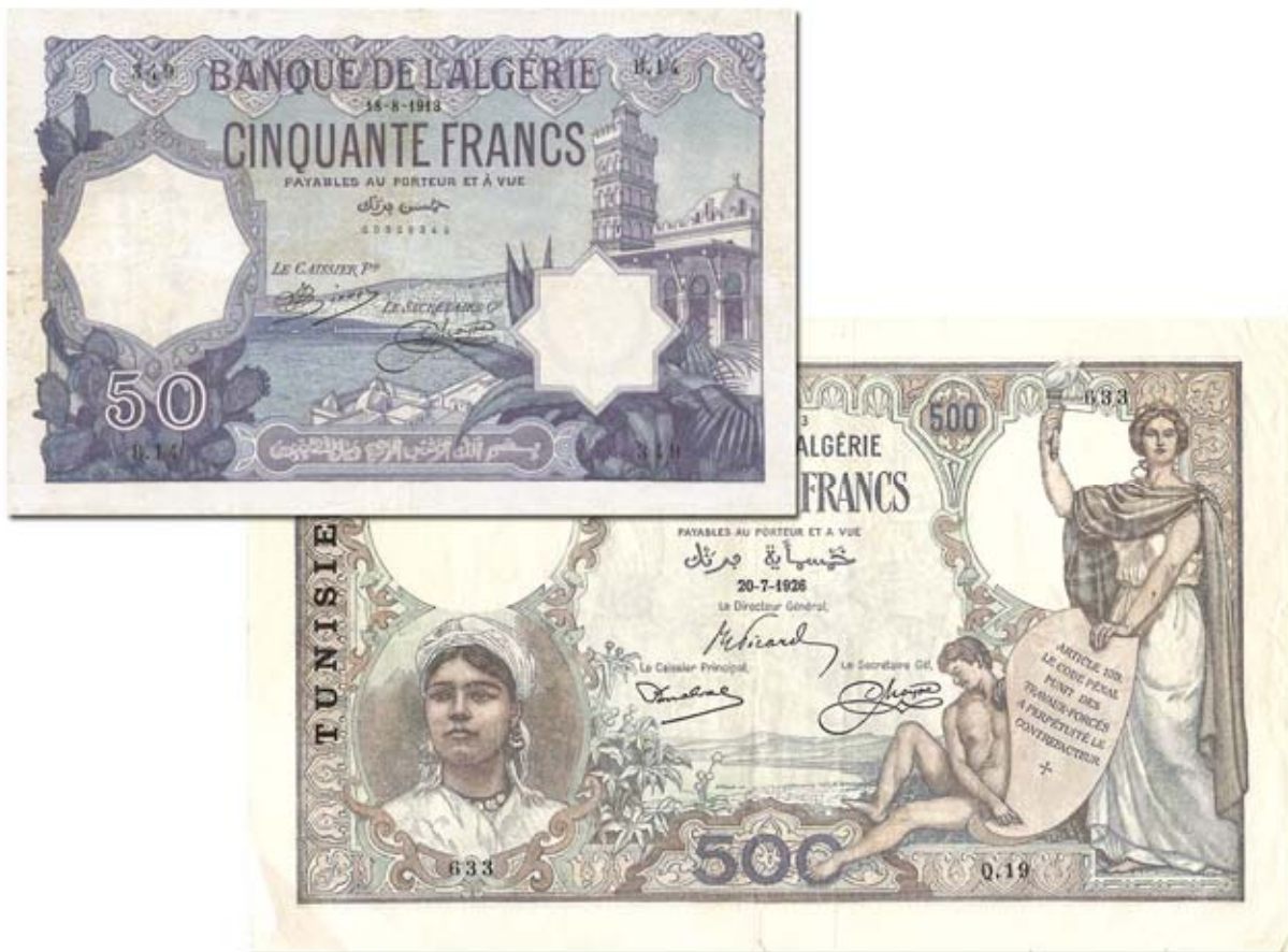
Two very rare notes from the multicolor series: an early 50 francs (blue and violet) dated 1913 and a 500 francs dated 1926 and overprinted TUNISIE