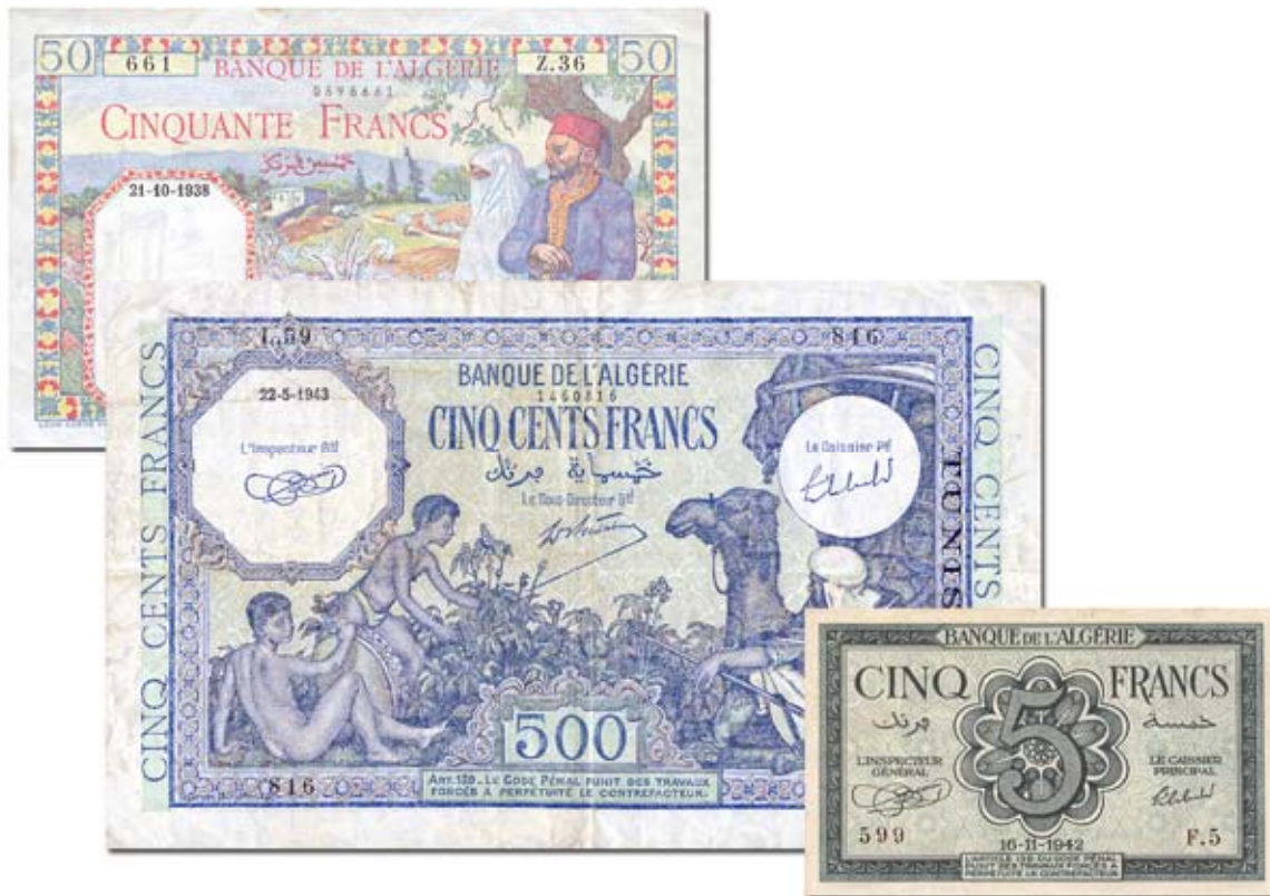
Wartime issues: Algeria 50 francs, 1938; Tunisia 500 francs, 1943; locally printed Algeria 5 francs, 1942

Color variants, printing quality and watermark varieties play a particularly important role in working out the bank note issues of this period. The bulk of these notes were issued under France's Vichy government, which had control of Algeria and Tunisia from 1940. In 1942 Allied forces landed in Algeria and squeezed the Axis forces into a defensive posture in Tunisia, and by May 1943 both Algeria and Tunisia were under Allied control. During this turbulent period resources were limited and the ability to produce high quality bank notes was neither a high priority nor an achievable goal. One of the most dramatic changes during this period is a drop in the quality of the paper. During the early years the access to fine watermarked paper was uninterrupted. In 1942 new paper with a simplistic lettered watermark reading BANQUE DE L'ALGERIE was placed into use. The new paper was somewhat coarse and proved inadequate for high quality printing but was used anyway. The fact that wartime restrictions in trade made it hard for the printers to obtain the usual ink supply didn't help matters either. The result was a sharp decline in the printing quality of notes during the period from 1942-1945.