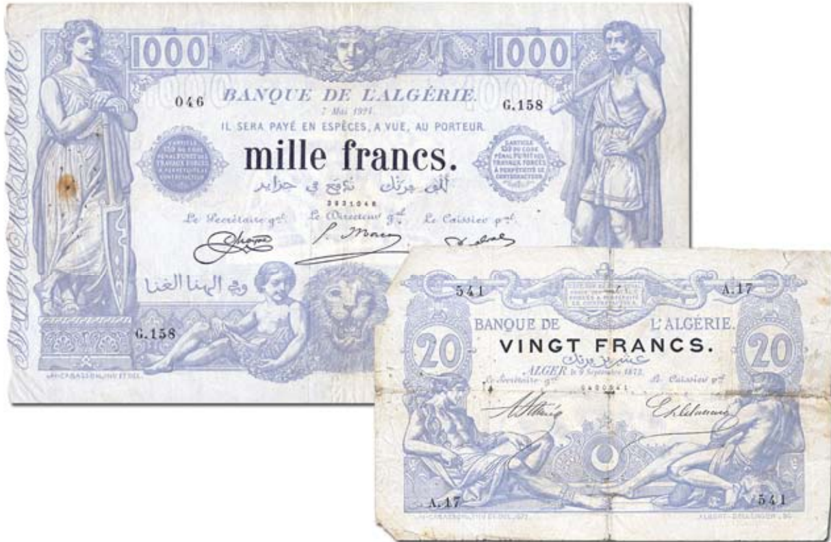
Two examples from the blue series: a 1000 francs note dated 1924 and a 20 francs note dated 1873

Les types bleus (or “blue series”) are the first really collectable issues, and date from 1873 up to as late as 1925. These notes were designed in the early 1870's by the French artist Guillaume Alphonse Cabasson. Cabasson's designs were typical of French notes from this period, based on Greco-Roman allegory and rather generic instead of being directly related with the place of issue. The pale blue ink used in this series was selected in the 1860's by the Banque de France to thwart photographic counterfeits (previously the bank had printed notes in black).