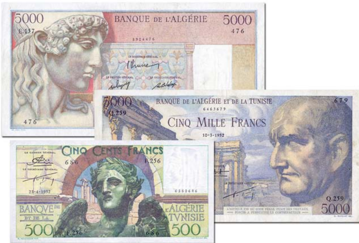
Algeria 5000 francs, 1947; Tunisia 5000 francs, 1952; Tunisia 500 francs 1952