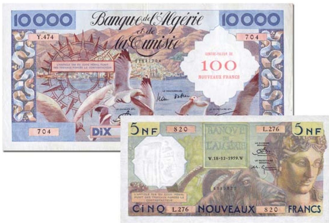
Old 10000 franc note overprinted with “100 nouveaux francs” and 5 new francs note, both from 1959-60.

In May 1958 rising concern that the French government was softening on the issue of Algerian nationalism caused the European colonists to combine forces with the French army against the government in Paris. Charles de Gaulle was returned to power by the end of the month, and on 28 September 1958 the French people confirmed by vote his new Fifth Republic. Most of France hoped that the new government would finally be able to achieve peace in Algeria without losing control of the colony. Among the many changes brought about by the Fifth Republic was the introduction of the “new franc”. From 1 January 1960 one hundred francs would be equivalent to one “new franc”. This move was a politically motivated strategy intended to bolster confidence in the failing French currency. After the revaluation the franc would once again have the same purchasing power it did at the beginning of World War I.