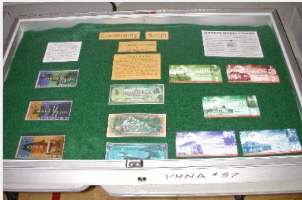
Class 5 — General or Specialized 1st Place — Del Cushing — Community Script [Exh-2008-5]