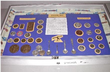
Class 6 — Pacific Northwest Numismatic Material 1st Place — Del Cushing — Totems on Northwest Collectibles [Exh-2008-2]