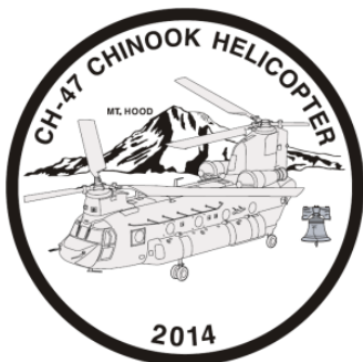
2014 Club Medal & Wooden Nickel

A limited number of dealer tables may still be available ... ask Greg.