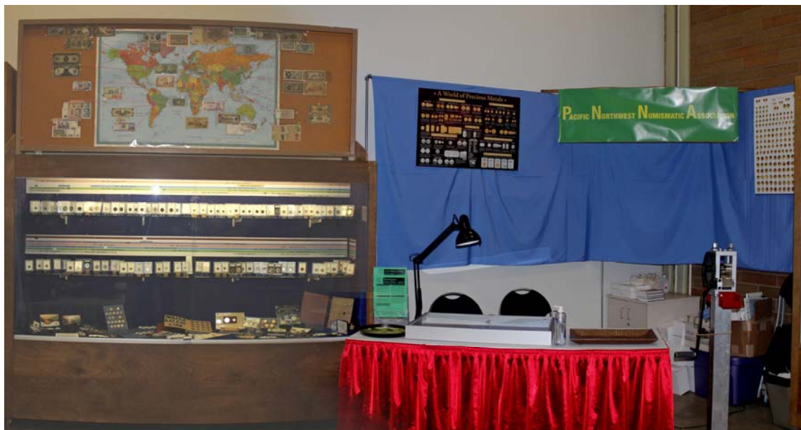
Photo: The PNNA's display at the 2013 Washington State (Puyallup) Fair.